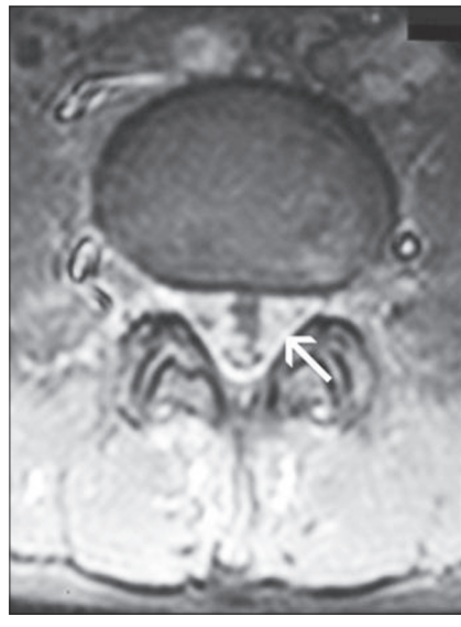
Figure 2: Leptomeningeal involvement (white arrow).

side (ICE) on 20 June 2009; however, the patient's clinical condition deteriorated gradually and he died due to respiratory failure on 15. day of the chemotherapy cycle.