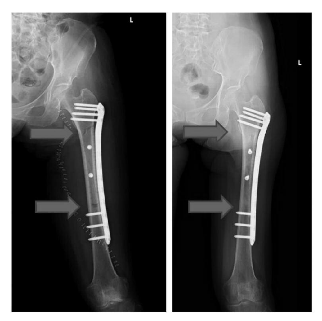
Figure 2. Images showing the post-operative radiograph (Case 8). Arrows show the osteotomy sites. After 11 months, there is sound incorporation of the autograft (left: 1 week after surgery; right: 11 months after surgery).

pasturised autograft for parosteal osteosarcoma of the distal femur, have reported that the mean time to union was 11.2 months (13). Although there has been no report concerning bone fusion and hemicortical autograft when using the liquid nitrogen method, there may be no differences in duration until complete bone union depending on bone graft recycling methods.