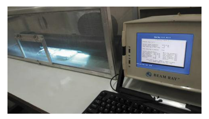
Figure 2. The pulsed electromagnetic field system where the Ar-filled plasma tube is placed inside a Faraday aluminium cage with the microwell plates 2.5 cm below the plasma tube.

methodology of preparing the breast cancer cell samples was modelled using perfusion techniques already prepared by the Molecular Science Unit of De La Salle University, Philippines. In essence, the samples used were a replication of the in vivo phenotype. These samples were equally placed in each well of five 96-microwell plates (8 rows×12 columns) – four for the treatment group and one for the control group – with 25 \mu l of cells placed in each well at approximately 70% confluence. The cells to be treated with PEMF were placed inside a mesh or Faraday cage that was targeted by modulating resonant frequency propagated by a 3.3 MHz carrier frequency. To minimise collateral exposure of the neighbouring samples, aluminium foil was placed on the microwell plate to cover it, as shown in Figure 1.