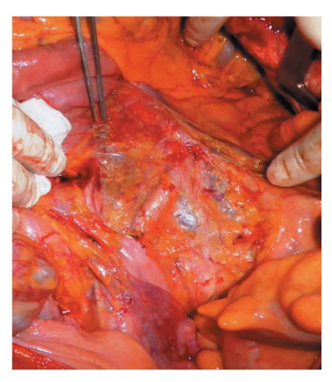
Figure 4. Large para-aortic adenopathic mass.