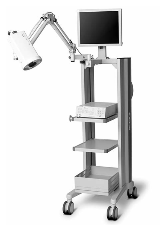
Figure 1. HyperEye Medical System (HEMS) illuminates the ICG with an array of light-emitting diodes (LEDs) and the CCD camera captures the ICG fluorescence images. Then the fluorescence image is shown on the imaging monitor. ICG, Indocyanine green; LED, light-emitting diodes; CCD, charge-coupled devise.

Table II shows the results of SLN biopsy. Nineteen consecutive patients with head and neck cancer underwent SLN biopsy using RI and/or ICG or ICG alone. The mean duration of follow-up was 38.5 months (range=10.7-69.9 months).