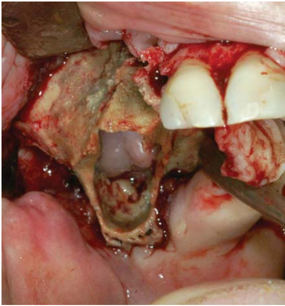
Figure 1. Extensive osteonecrosis of right maxilla in a 57-year-old patient with metastasizing breast cancer. She was treated with i.v. zoledronate for 4 years and had undergone extraction of an upper premolar tooth 2 years earlier.