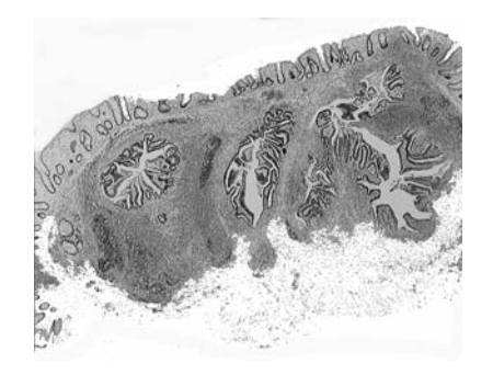
Figure 2. Lack of MLH1 immunoreactivity in GALTC (protruding phenotype, MLH1, ×2).