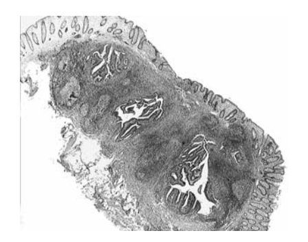
Figure 1. Low power view of GALTC (protruding phenotype) ( H\&E \times 2 ).