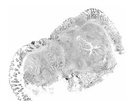
Figure 3. GALTC showing high cell proliferation (protruding phenotype, Ki-67, clone MIB1, ×2).