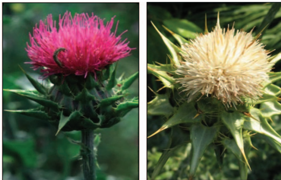
Silybum marianum (Milk Thistle)