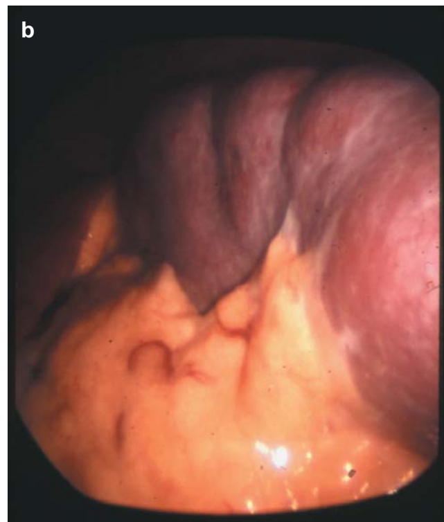
Figure 2. a. Laparoscopic view of splenic lobulation in the medial part of the spleen. b. Laparoscopic view of multiple spleen lobulation.