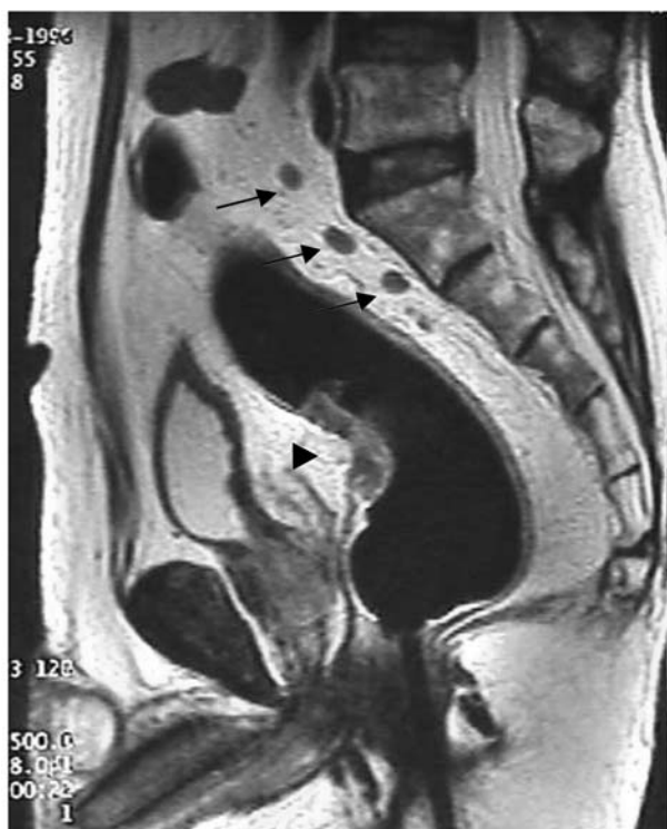
Figure 1. Rectal carcinoma and lymph node metastasis on MRI. (stage T3, N1) (T2-weighted imaging, sagittal section). Arrows indicate metastatic lymph node from 6 to 10 mm in longitudinal diameter with ellipse shape and minor heterogeneous internal structure. An arrowhead indicates the tumor.

longitudinal axis and stained with hematoxylin and eosin. Pathological slides were reviewed by pathologists who had no preoperative MRI information. On MR films, these measurements were also obtained and compared with pathological findings. An optimal preoperative criterion on MRI was clarified by receiver operating characteristic (ROC) analysis (20-22).