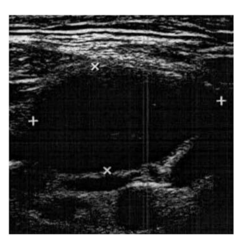
Figure 1. Cropped image of a print-out of the B-scan ultrasonogram of the left neck. The anechoic oval lesion appeared to have distinct borders. The lesion had displaced the sternocleidomastoid muscle (left). Its ultrasonographic appearance makes invasive growth of the lesion unlikely.

The present case was managed by adequate surgical excision followed by postoperative radiotherapy. Local control was achieved by this strategy. However, MEC can arise in the field of irradiation (20). Recently an MEC case was reported with CUP of the neck and further tumour spread, despite ablative surgery and radiotherapy (6). In