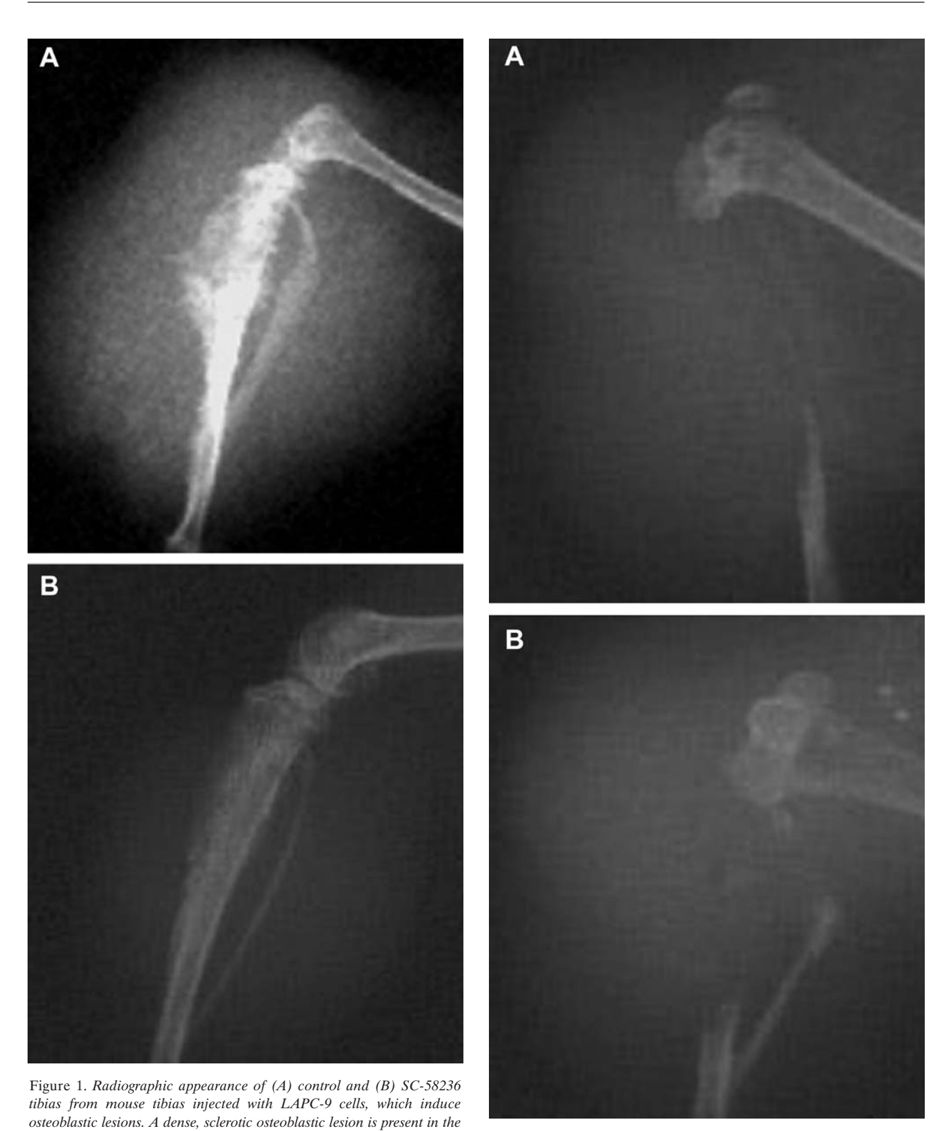
Figure 2. Radiographic appearance of (A) control and (B) SC-58236 tibias from mouse tibias injected with PC-3 cells, which induce osteolytic lesions. Near complete destruction of the proximal tibias was observed in control and treatment mice.

control lesion with extensive intramedullary and extramedullary new bone